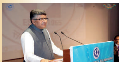
Shri Ravishankar Prasad Union Minister of IT

The Plenary Session was the highlight of Day 2 of the event with Shri Ravi Shankar Prasad the IT Minister of India's address . Mr. KT Rama Rao the IT Minister of Telangana was the Guest of Honor who spoke and gave away the CSI awards