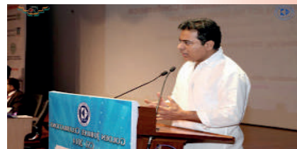
Mr. KT Rama Rao, Telangana Minister for IT

It also wanted to make Hyderabad a top notch destination for the IT industry. Chief Minister wanted priority for the State in the National Optic Fibre Network programme that seeks to provide broadband connectivity to 2.5 lakh in the country, he said.