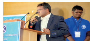
AS Ramesh Director IT, Govt of Telangana

National Cyber Security Policy 2013 estimates the need for five lakh cyber security professionals and the state wants to impart cyber security training to as many engineering students as possible.